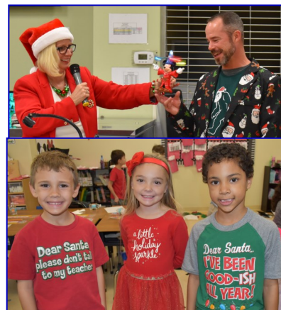
Students and staff got into the holiday spirit during festivities in December.