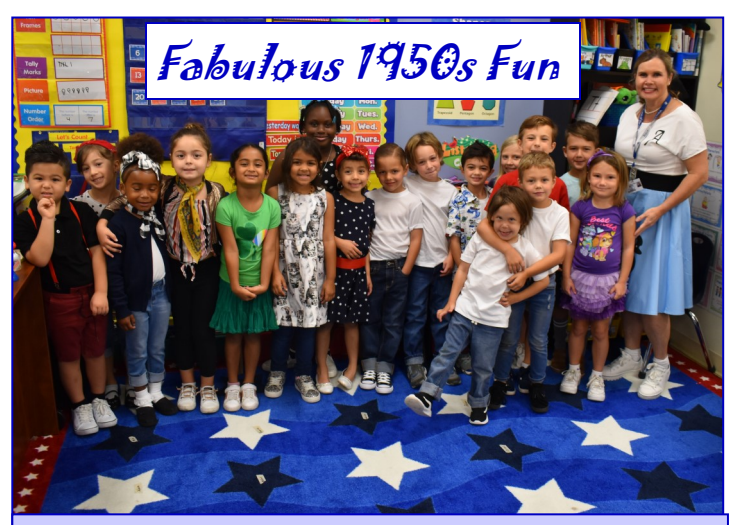
Kindergarten students and their teachers dressed in Fab '50s Oct. 6.