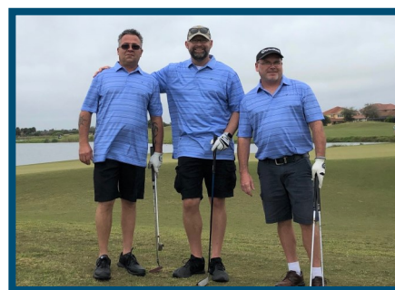
A Gold level golf team and VCS parents.