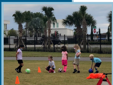
Kindergarten meets for their first soccer practice.

K-6 th grade soccer practices began on Monday, Dec. 14 th . The season starts in January. There was a great turn out this year! We had a whopping total of 68 students sign up. Enough to make 1- Kindergarten, 3- 1 st /2 nd grade teams, 1- 3 rd /4 th grade team and 1- 5 th /6 th grade team.