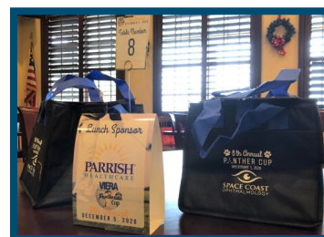
Our lunch sponsor, Parrish Healthcare, and prize by Space Coast Ophthalmology.