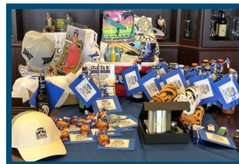
Our many raffle prizes.