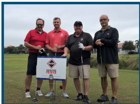
A tournament golf team.