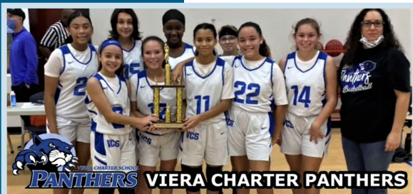
The Girls Basketball team photographed with their trophy after the game.